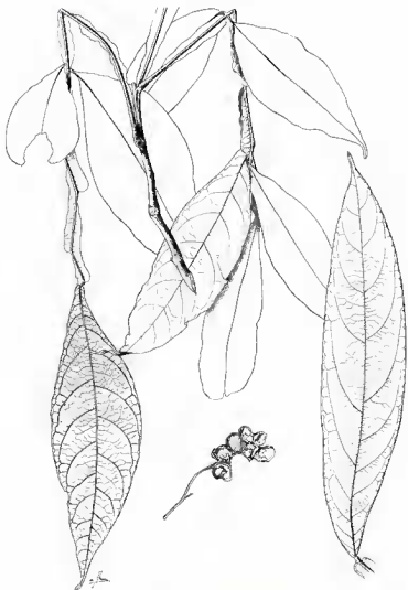
Pl. 5. — Archidendron Royenii Kosterm. : P. van Royen 5309 (BO).